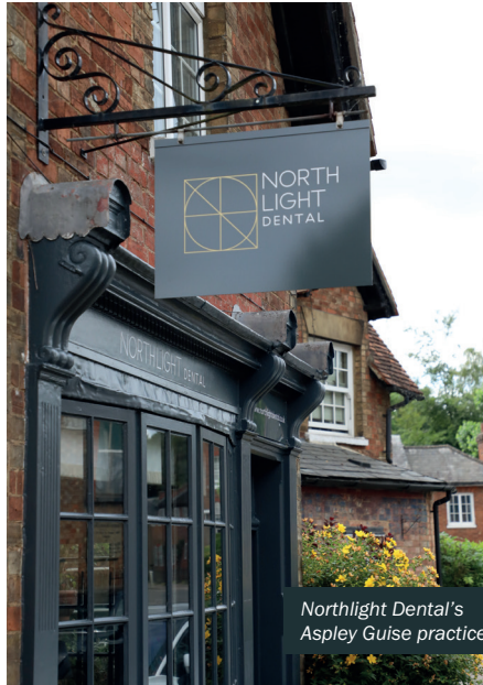
Northlight Dental's Aspley Guise practice

Over time, the implant fuses with the jawbone in a process called osseointegration, creating a stable foundation. This not only allows the implant to hold a replacement tooth or bridge firmly in place, but also helps maintain the jawbone's shape and density. The result is a durable and long-lasting solution that can help restore function and aesthetics making eating, speaking, and smiling feel completely natural again.